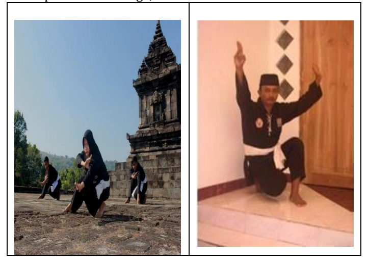
Fig. 1. Style PSHT

religious life of humans. Symbolic Action, this is long-term in nature and is usually used by humans in communicating with others. This symbolic action provides something that can benefit humans, because there is a reciprocal relationship that occurs when this symbolic action takes place. (Budiono Herusatoto, 2008) Symbols are artificial signs that are not in the form of words, which are used to represent or reveal a certain meaning. In addition, symbols are often associated with signs, where the relationship between signs and objects (The Liang Gie, 1997). Culture by Tylor is defined as a complex whole including knowledge, beliefs, laws, morals, customs and various abilities and habits acquired by humans as members of society. Cliffort Geertz (1973-89) defines culture as a symbolic system of meanings, by which we understand and give meaning to our lifestyle. Culture refers to a pattern of meanings embodied in symbols that are handed down historically, which are expressed in symbolic form. Through symbols humans convey, preserve, and develop their knowledge, attitudes and beliefs about life.