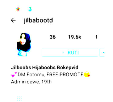
Fig. 1 Biography of @jilbabootd

This account is interesting to be analyzed and review, in addition, this account has a 19 y.o a female admin who uploads only 36 photos but has followers of 19 600 000 and only follow 1 account. This is public account not private, anyone can see the pictures without becoming a follower. This account has the majority of male followers and the account is active. Posted photos from the admin always get 'love' tag and comments from the followers. Unlike the admin on a similar account, admin on account @jilbabootd dare to show herself in sexy selfie photos.