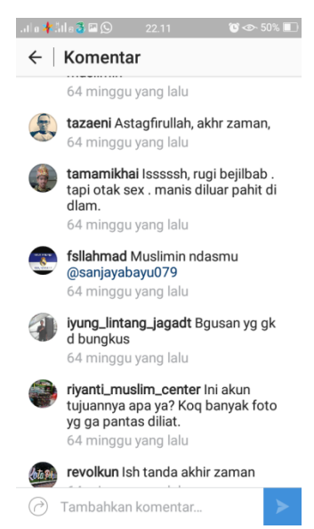
Fig 4 Comments in account @jilbabootd